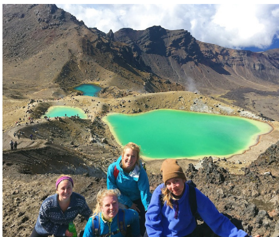
Study Abroad students at Emerald Lakes, a stunning part of Tongariro Alpine Crossing.