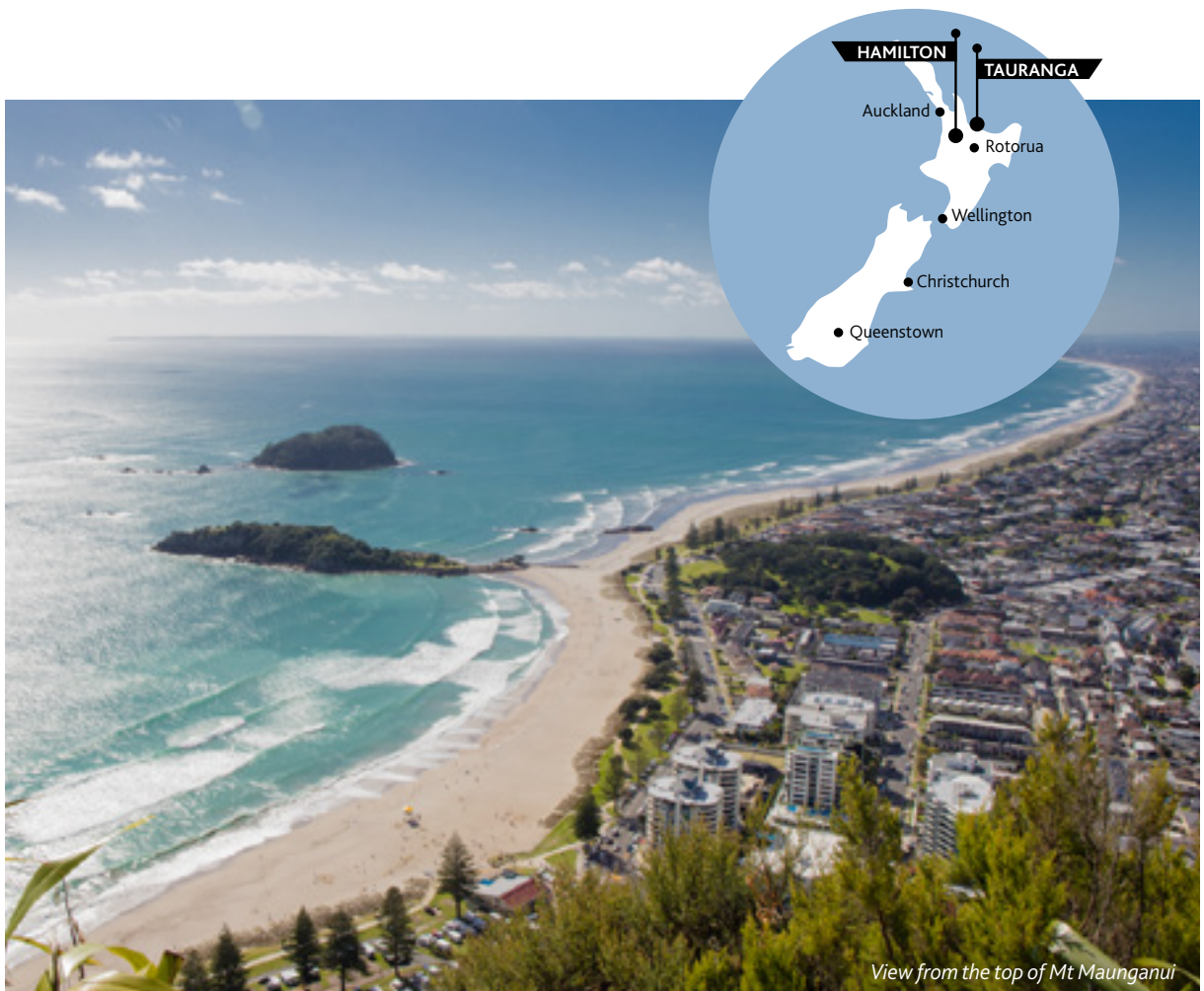
View from the top of Mt Maunganui

Find out more about Tauranga and the Bay of Plenty region at bayofplentynz.com