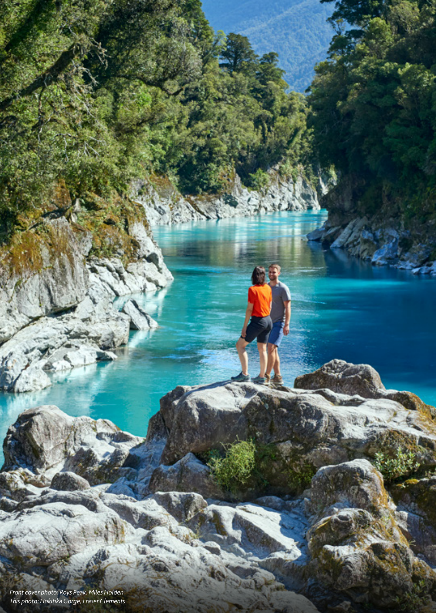
Front cover photo: Roys Peak, Miles Holden This photo: Hokitika Gorge, Fraser Clements