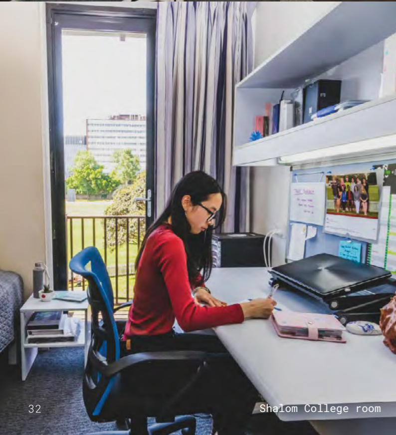
Shalom College room