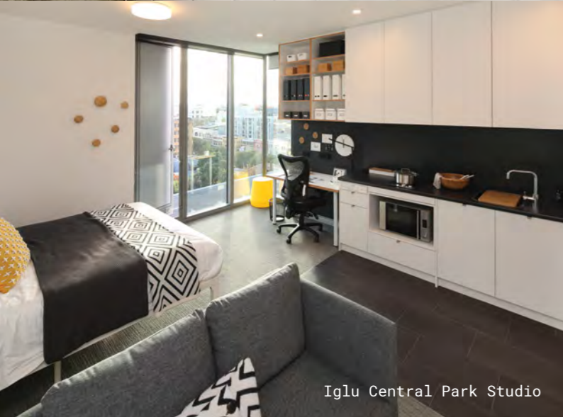
Iglu Central Park Studio