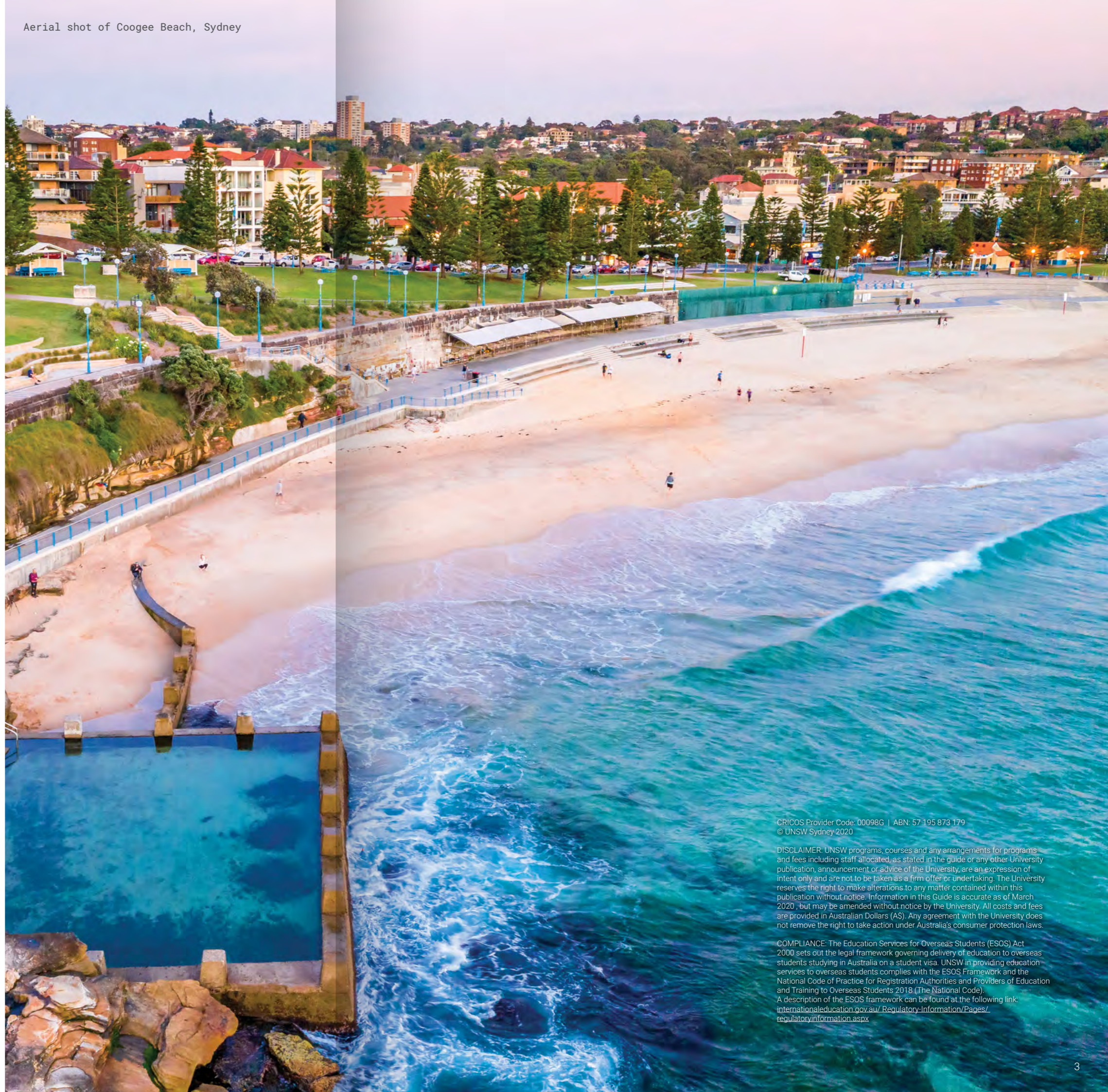
Aerial shot of Coogee Beach, Sydney