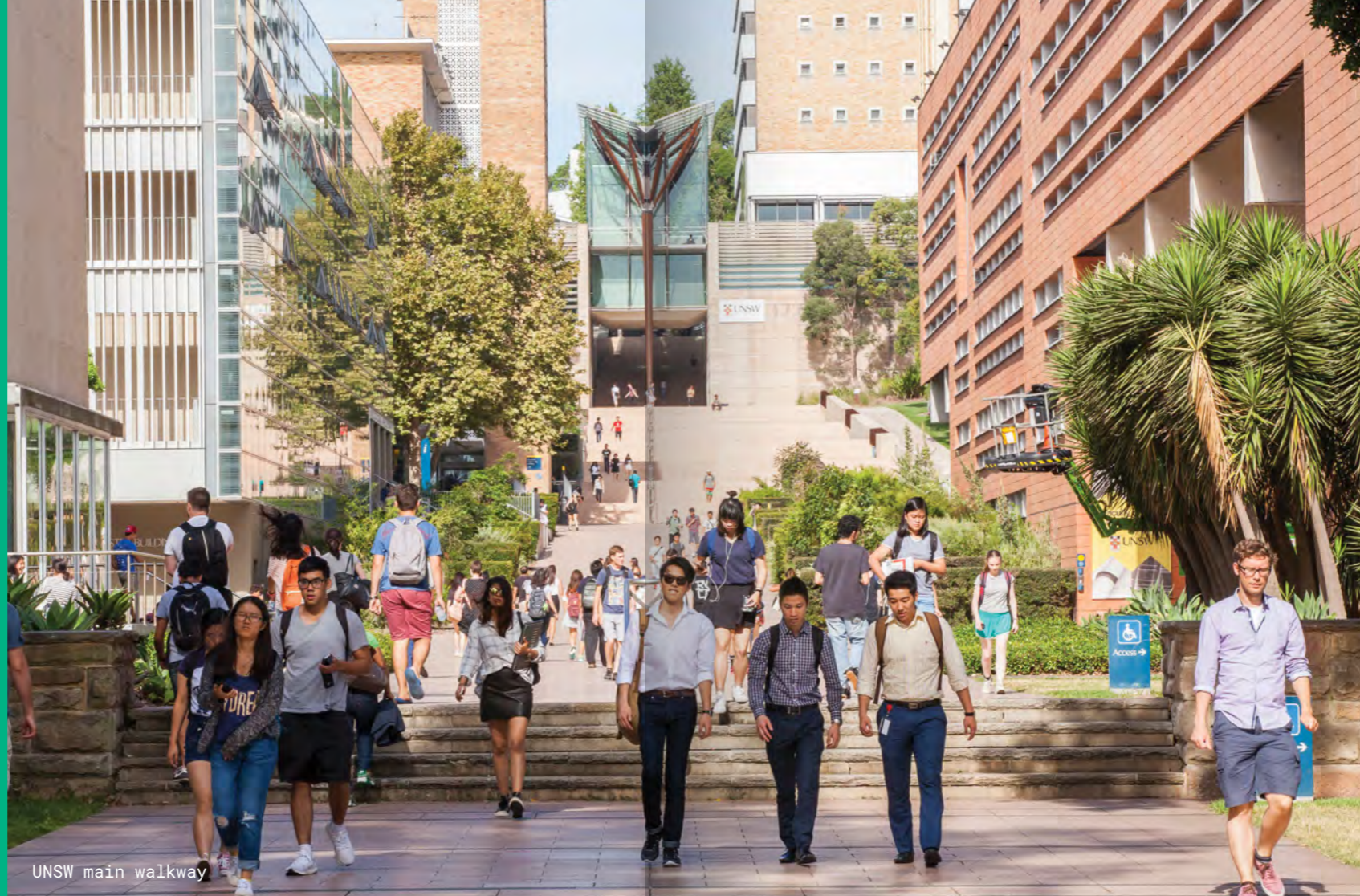
UNSW main walkway

A top 50 university with fantastic campus life!