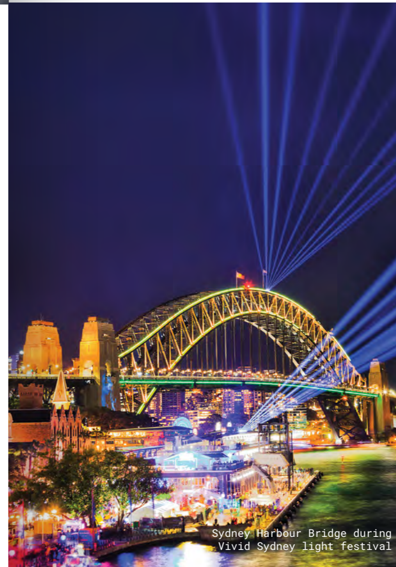
Sydney Harbour Bridge during Vivid Sydney light festival