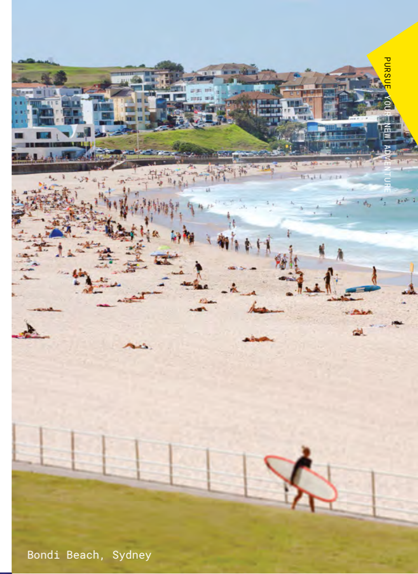
Bondi Beach, Sydney