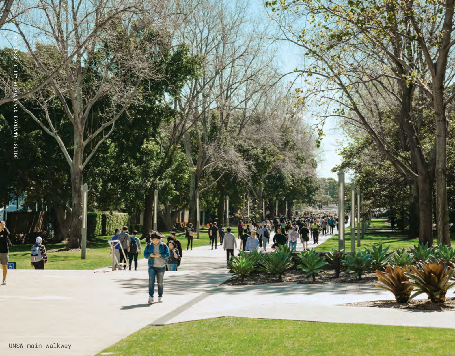
UNSW main walkway