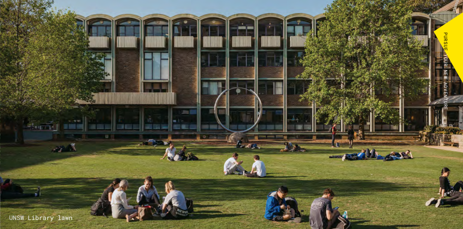
UNSW Library lawn

Arrangements must be made for students under 18 years of age. These requirements are in line with Australian Government regulations for the care and welfare of international students under 18. student.unsw.edu.au/visa18