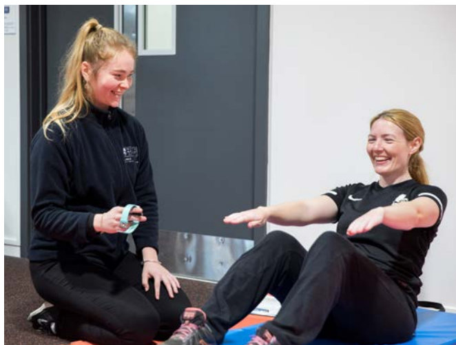
Health and Rehabilitation Clinic

Maximise your study abroad experience through our short-term programmes and unique opportunities.